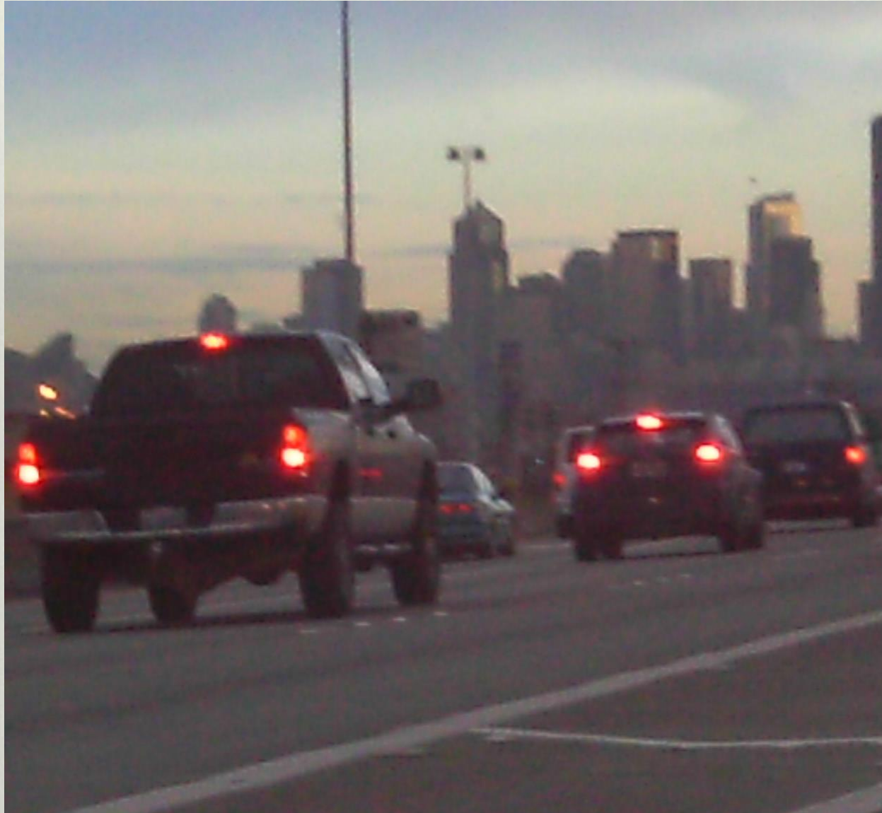
10NS2 - Like Any Other Day

This picture depicts any ordinary day, on my way to school, this is often the road most travelled.